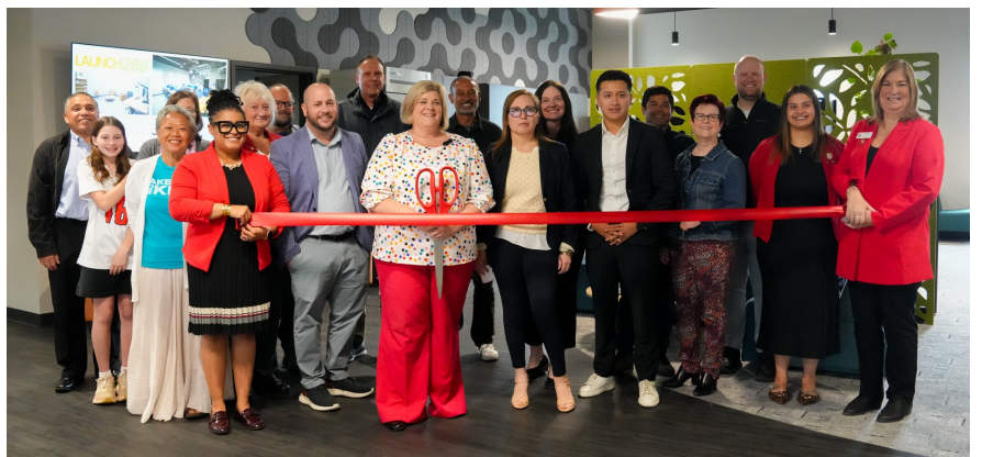
BELOW: The ribbon cutting ceremony for Launch 269, the coworking space located at the Battle Innovation Hub, held on May 5.