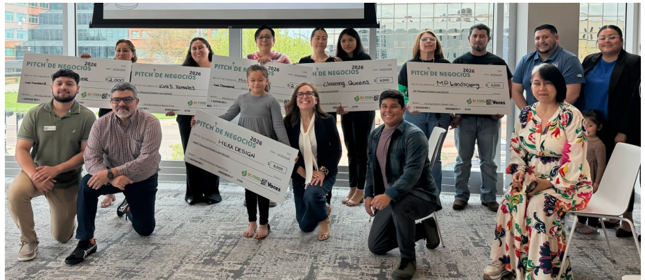
ABOVE: The winners of the Voces Business Pitch, held at the Battle Creek Innovation Hub.

BCFR proudly celebrated the opening of Launch 269, our new collaborative workspace located on the second floor of the BC Innovation Hub. The space includes private offices, hot desks, meeting rooms, a workshop area, podcast studio, and event space. To learn more, contact BCFRinfo@BCfood.org