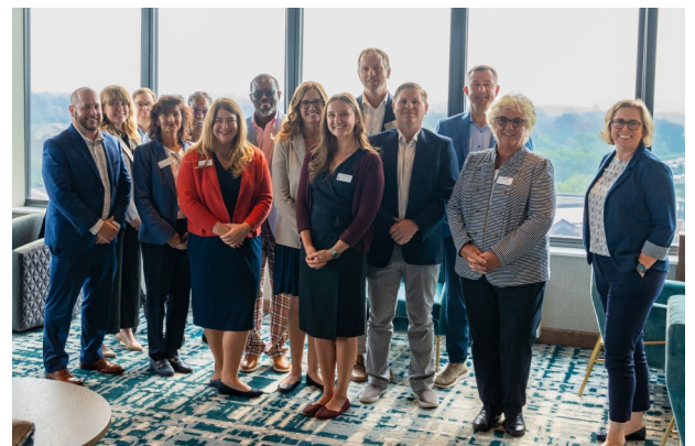
BELOW: Attendees pose on the 16th floor of the DoubleTree by Hilton.