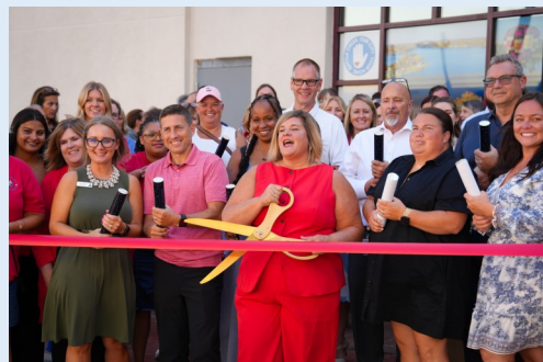
ABOVE: BCU attended the ribbon cutting ceremony for the new Battle Creek Area Chamber office on Michigan Avenue on Wednesday, July 23.

BELOW: The BCU team enjoyed a back-stage tour of the Binder Park Zoo on Friday, August 15. This was part of BCU's ongoing effort to familiarize staff with local nonprofit organizations and stakeholder groups. Past visits have include Kingdom Builders, New Level Sports, and the Washington Heights United Methodist Church.