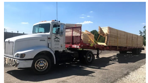
A ProTec truck delivers roof trusses to a job site.

For more information about ProTec including available jobs, visit protecmmfg.com