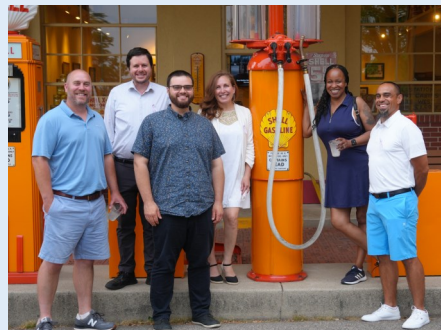
ABOVE: The BCU team attended the Bronson Cancer Care Spring Fling at the Gilmore Car Museum in June.