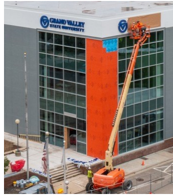
Workers recently completed the installation of the GVSU sign atop the Battle Creek Innovation Hub.