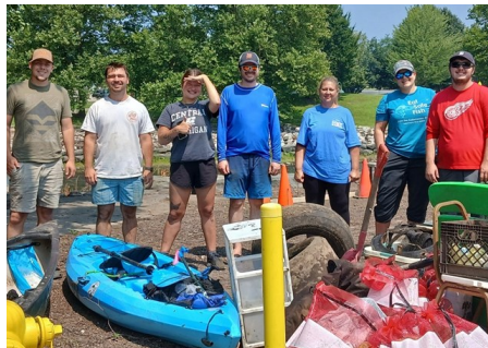
The BCU & DPW crew with some of the trash they removed from their clean-up.