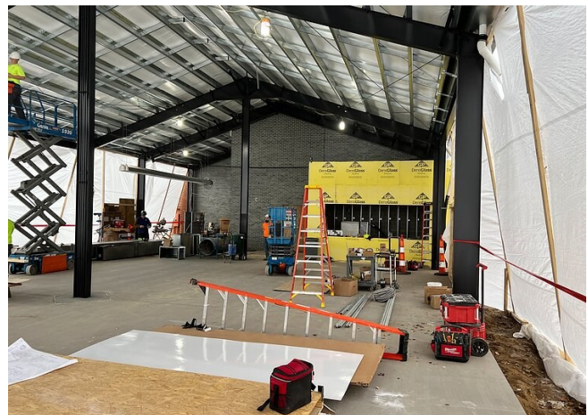
The scaffolding and construction wrap will soon come down at New Holland Brewing on Michigan Avenue in downtown Battle Creek.