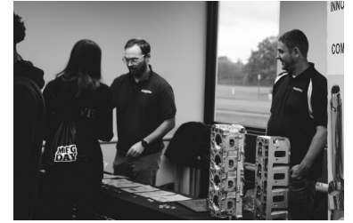
Bleistahl at the recent 2022 Manufacturing Day event.