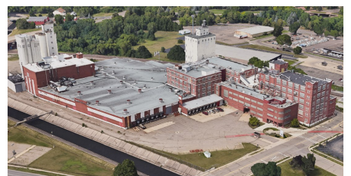
The TreeHouse Foods facility has 18 buildings on 18 acres.

Located along concrete-lined Kalamazoo River, the property is a key piece of the city's river naturalization effort. In July 2022, BCU was awarded a $13 million grant for the naturalization project.