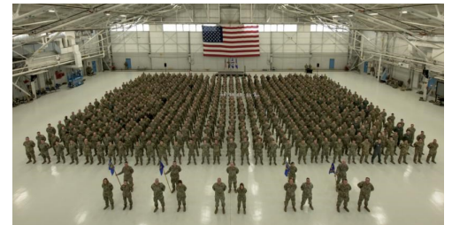
The 110th Wing of the Michigan Air National Guard