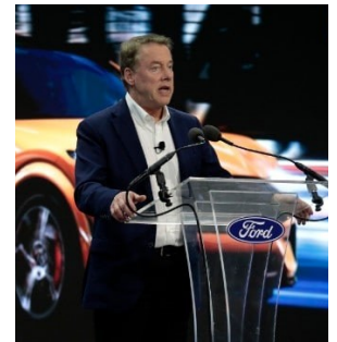
Ford Executive Chairman Bill Ford announces a $3.5 billion investment plan for a lithium iron phosphate (LFP) battery plant in Marshall.

Choose Marshall, the City of Marshall, Marshall Township, Calhoun County, the City of Battle Creek, and the many other organizations that have worked tirelessly for the last several years to market this property.