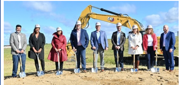
Officials from Kellogg Community College, the Battle Creek City Commission, and BCU pose with Duncan Aviation leaders at the recent groundbreaking ceremony.