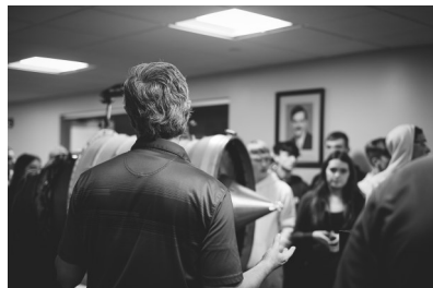
Students look at a jet engine from Duncan Aviation at the RMTc.