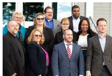
BCU staff pose for a picture at the open house for the new office.

The Customs Cargo Center has been BCU's home since it was built in 1978. The building was constructed at a cost of $2.4 million, financed by the U.S. Department of Commerce and the City of Battle Creek's Economic Development Commission. The facility provided rail and truck loading/unloading facilities, offices for U.S. Customs Border Protection personnel, a customs brokerage firm as well as office suites for startup companies. In 1986, the warehouse was expanded with a 50,000 square foot addition, with a portion of the space designated as Foreign-Trade Zone #43. Work on the recent renovations started in April 2018, and were completed in early October at a total cost of $1.8 million.