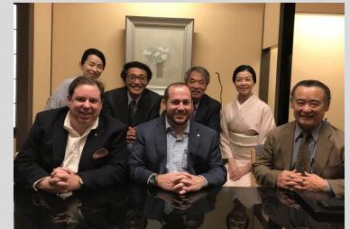
The BCU team at a dinner in Tokyo hosted by Toyota Tsusho.