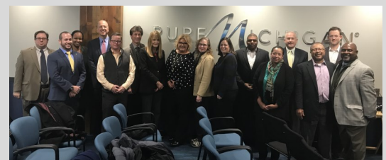
A delegation of Battle Creek community leaders attended the November meeting of the Michigan Strategic Fund Board where $10 million in project financing for Heritage Tower was approved.